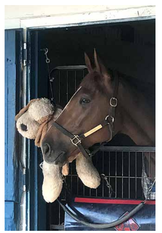
UNITED (Giant's Causeway - Indy Punch)